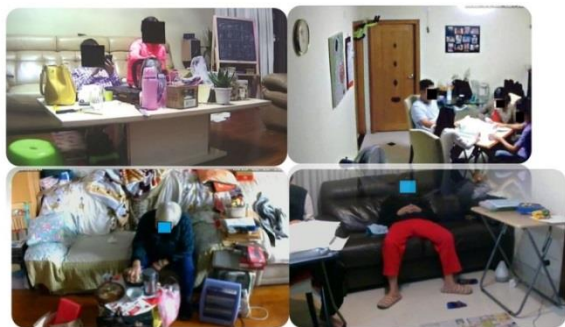
Exhibition of unsecured web-cam footages

• An exhibition in London featured footages of unsecured web-cams installed in HK; some screen shots even sold as art works