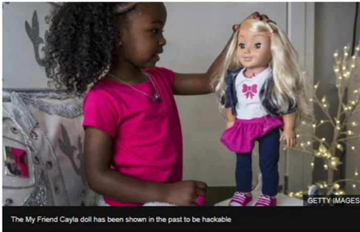
The My Friend Cayla doll has been shown in the past to be hackable

• First discovered by Norwegian consumer protection authority that the IoT toy might be used to spy on children