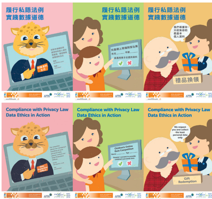
由私隱公署設計的「關注私隱運動2019」海報。 Posters designed by PCPD for the PAW 2019.

To disseminate the message of data protection to the wider community, PCPD also organised a series of promotion and education activities, including the Privacy Commissioner's interview on the radio programme "On a Clear Day" to promote the importance of data ethics, a radio drama series entitled "Privacy Clubhouse" and the broadcast of educational videos on social media and the eElderly website ( www.e123.hk ).