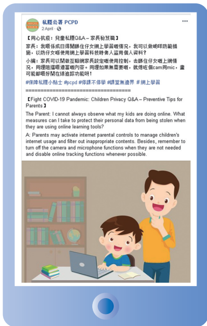
在 Facebook 發佈有關保障學生個人資料私隱的帖文 A Facebook post about protection of students' personal data privacy