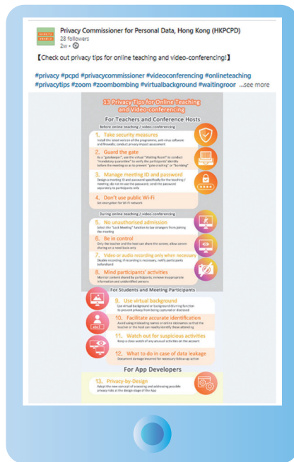
在 LinkedIn 發佈有關使用視像會議軟件時保障個人資料的貼士 Tips posted on LinkedIn for online teaching and video-conferencing