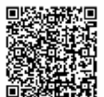
Download this Publication