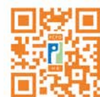
PCPD Website pcpd.org.hk