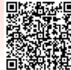
Abuse of AI Deepfakes: Toolkit for Schools and Parents