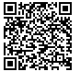
Smart Use of Smartphones