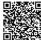
Sharenting Dos and Don'ts